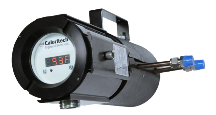
Figure 68 - PGH Series Heater